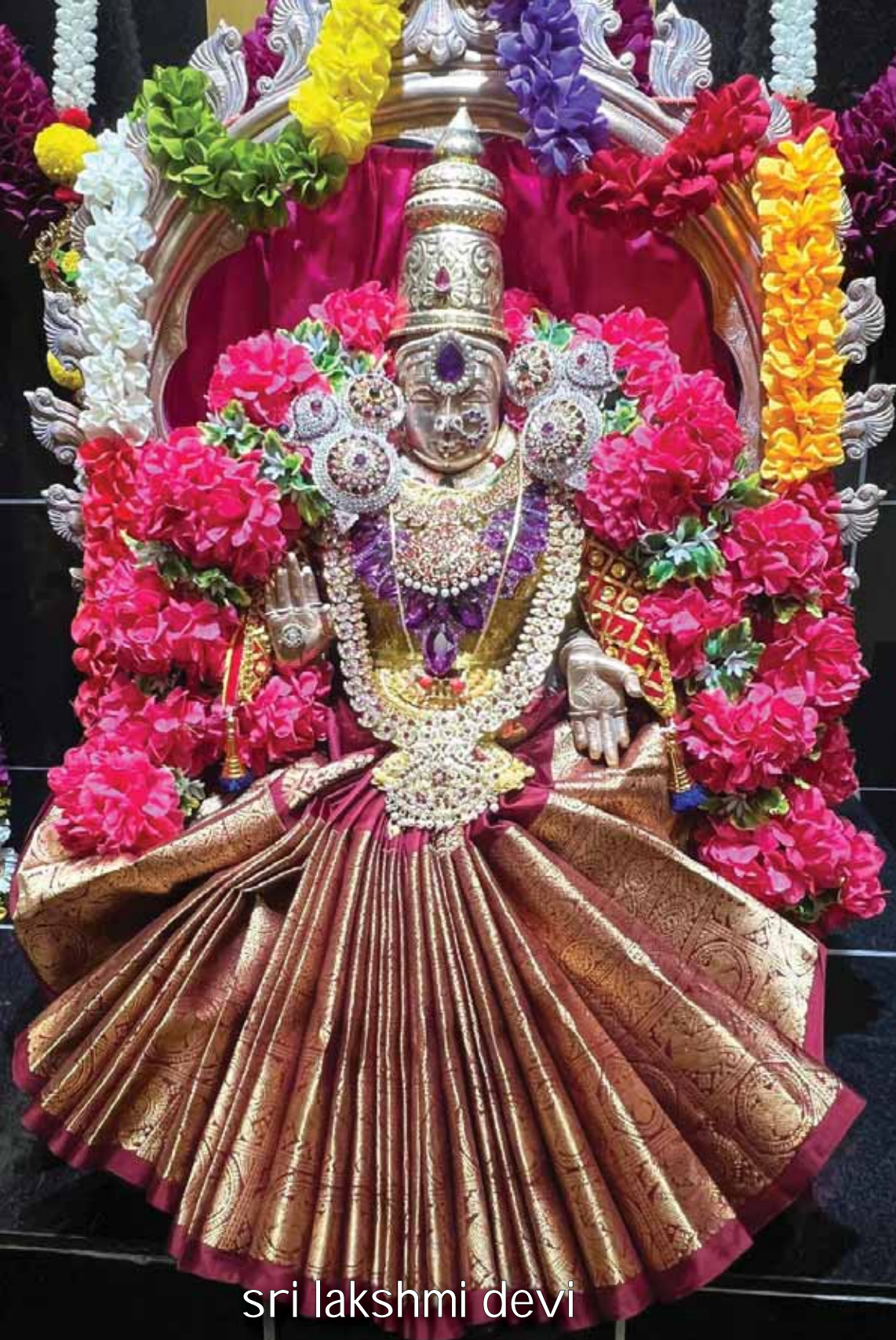
sri lakshmi devi