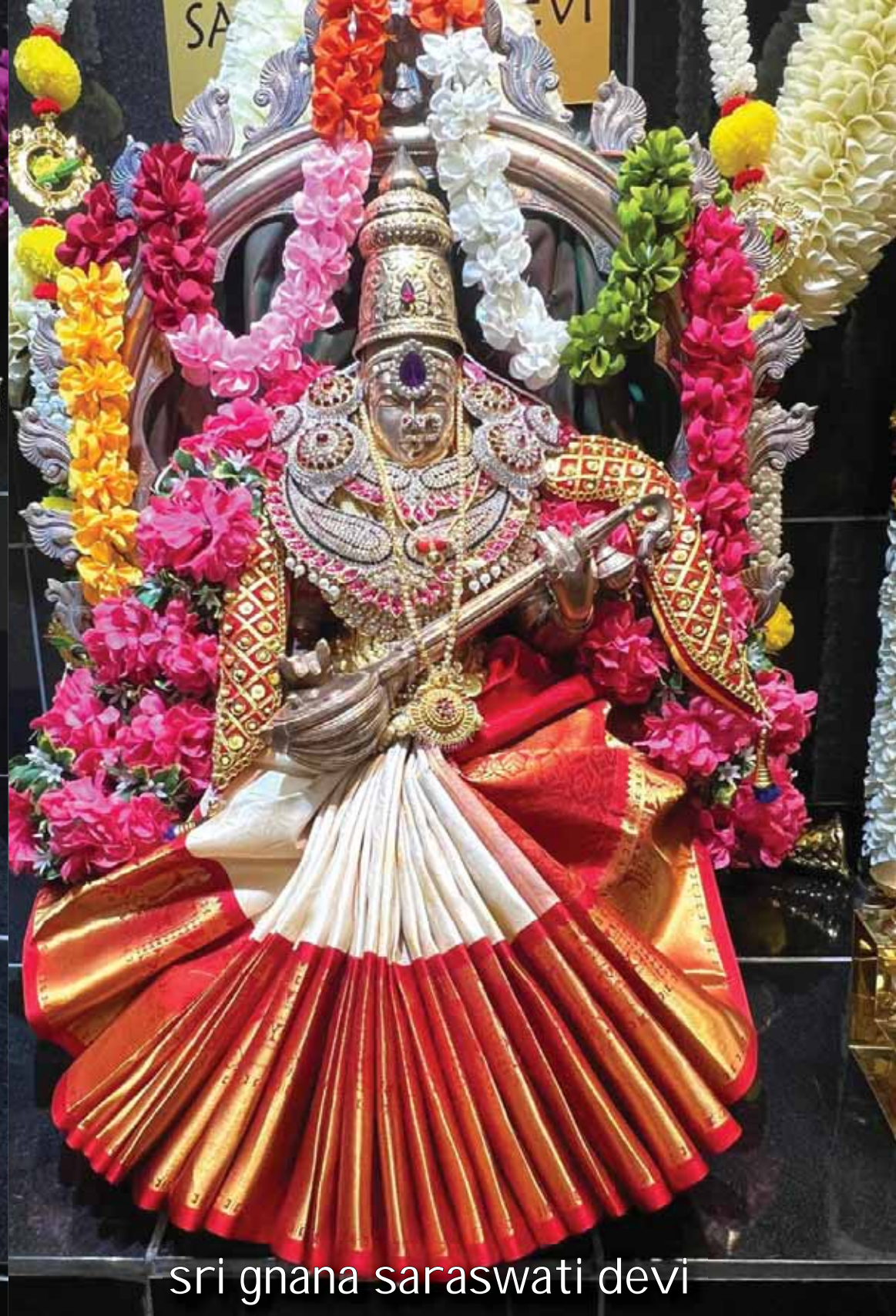
sri gana saraswati devi