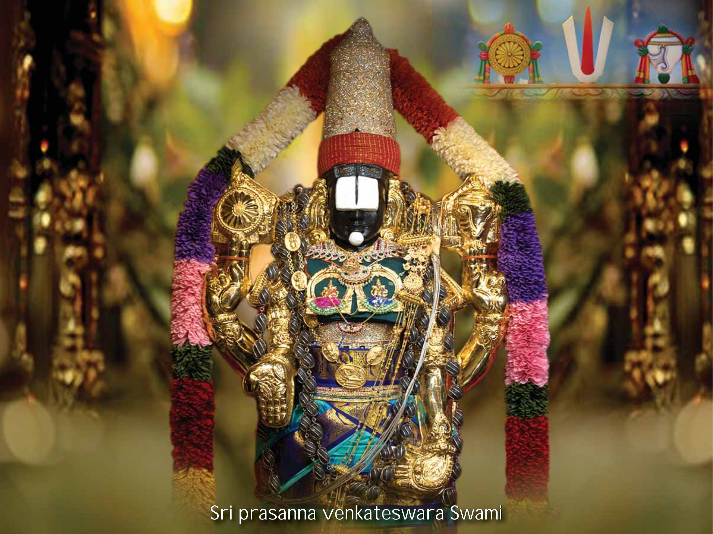
Sri prasanna venkateswara Swami