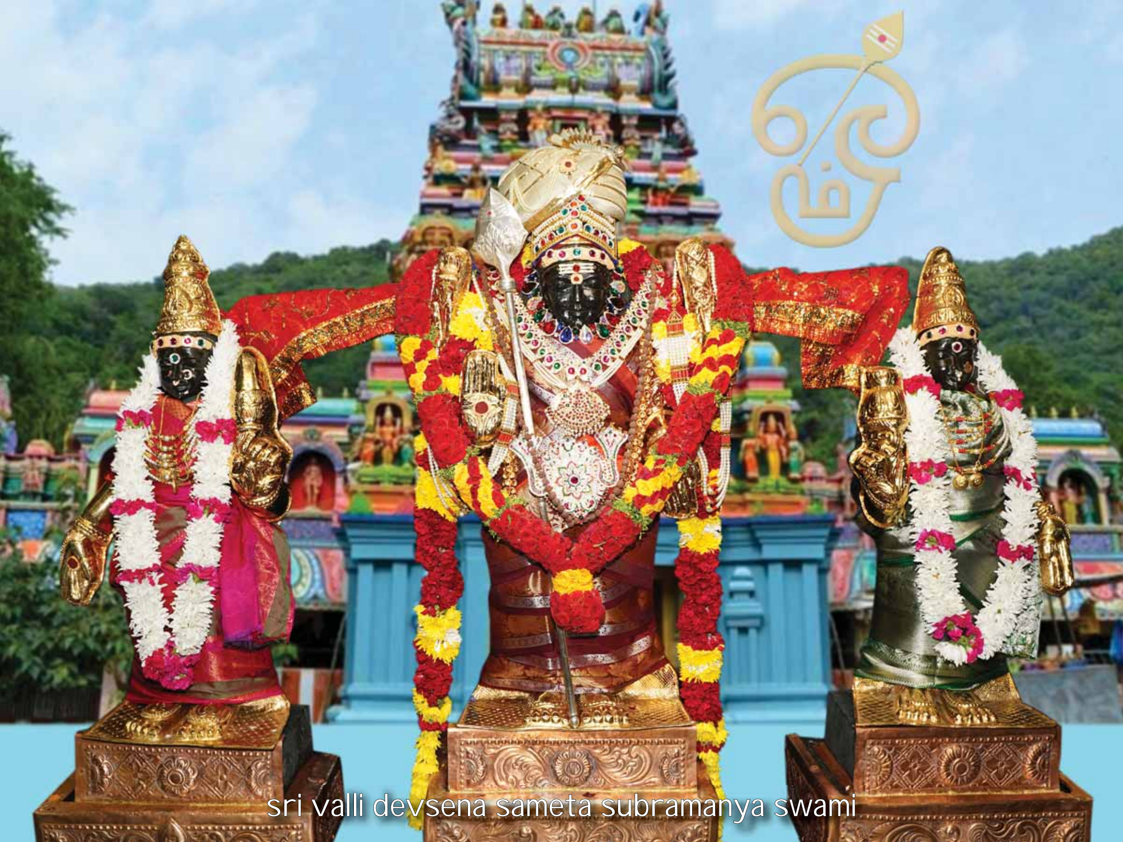
sri valli devsena sameta subramanya swami