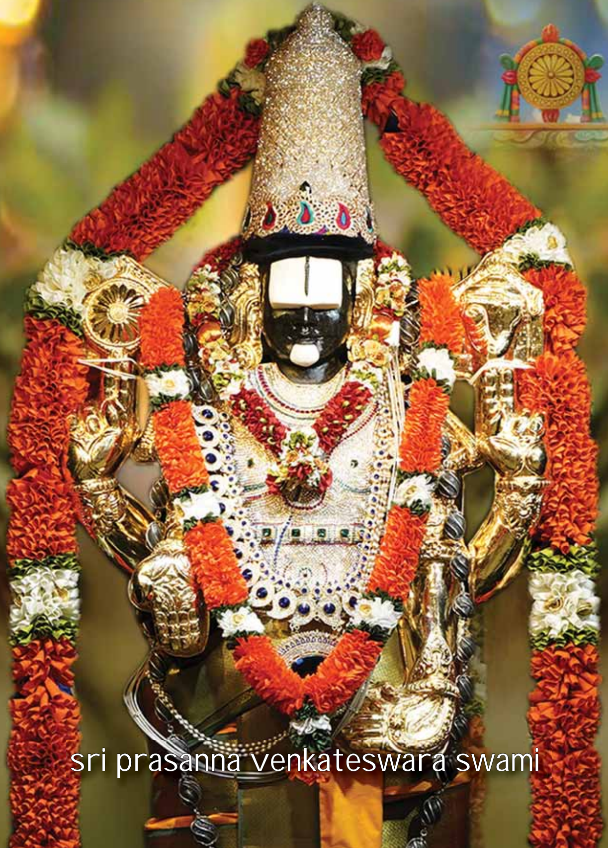
sri prasanna venkateswara swami