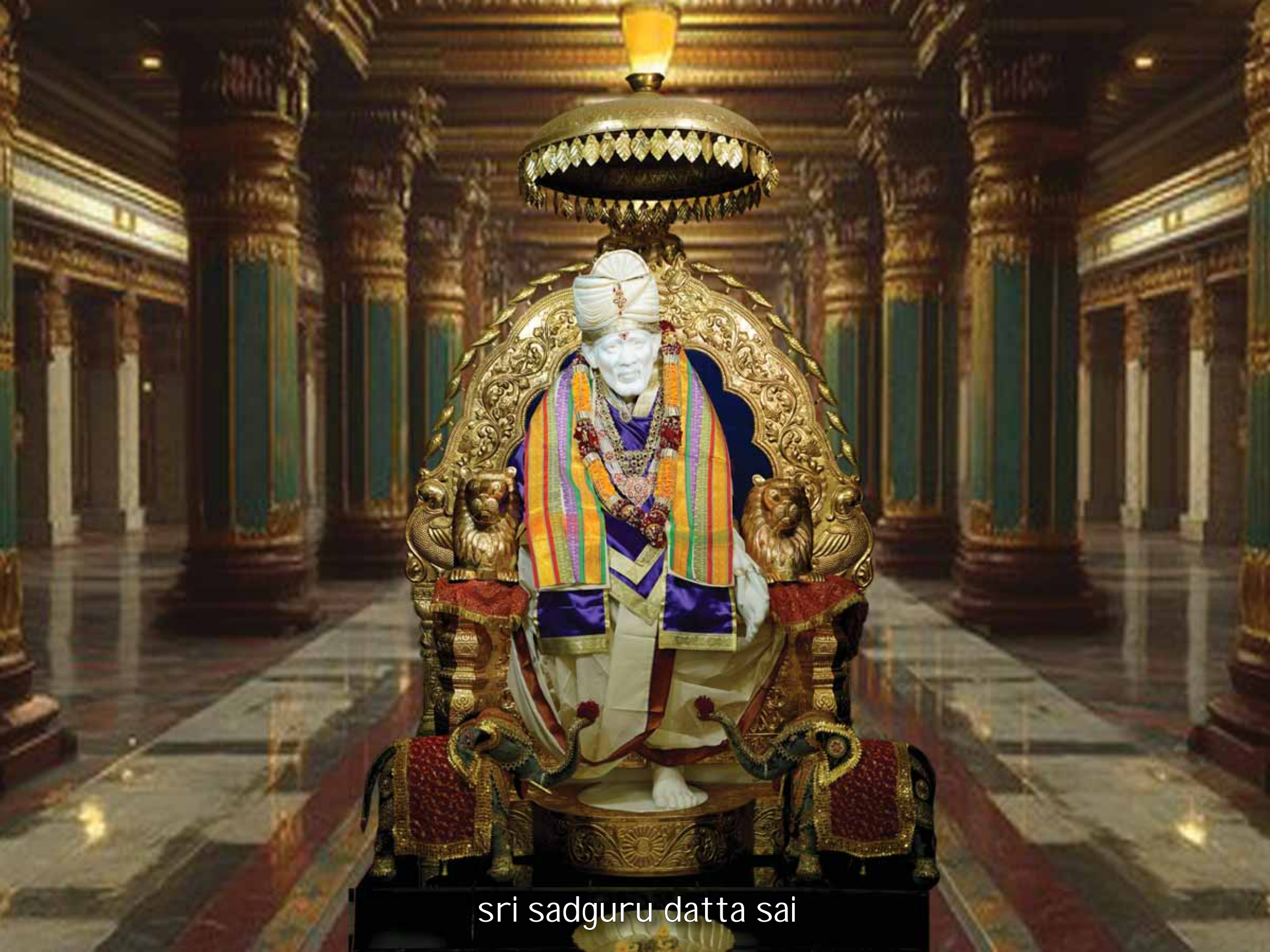
sri sadguru datta sai