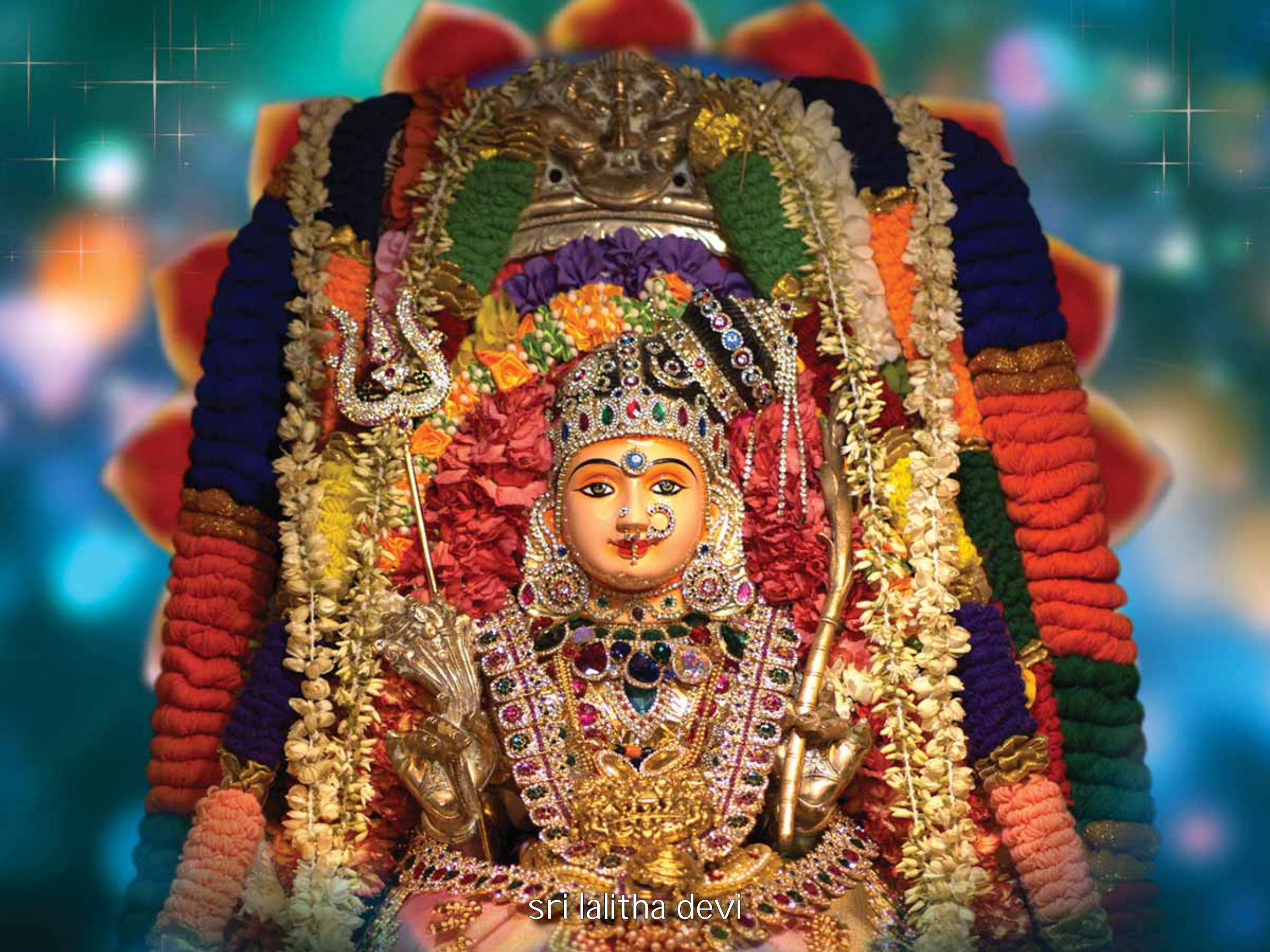
sri lalitha devi