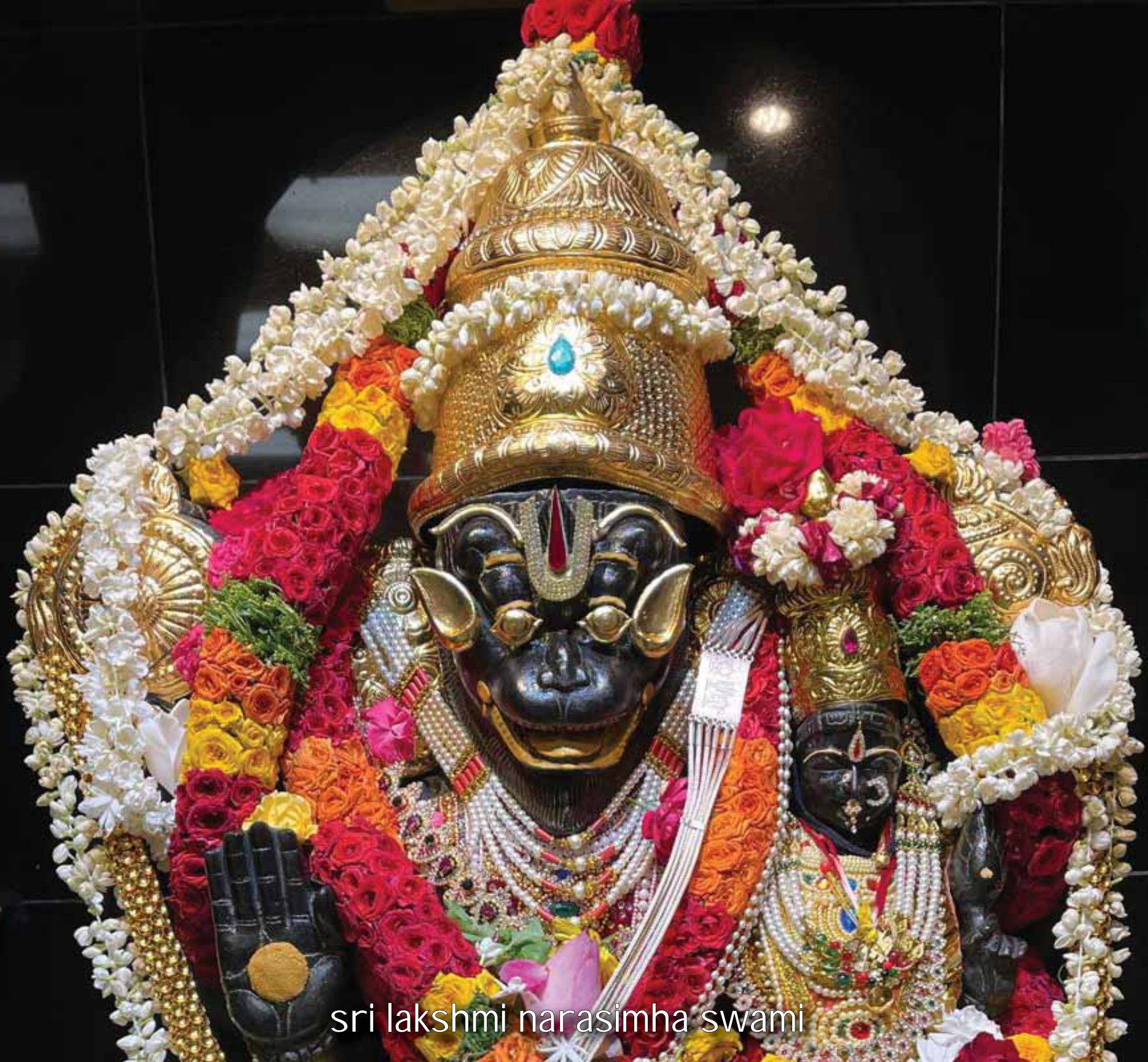
sri lakshmi narasimha swami