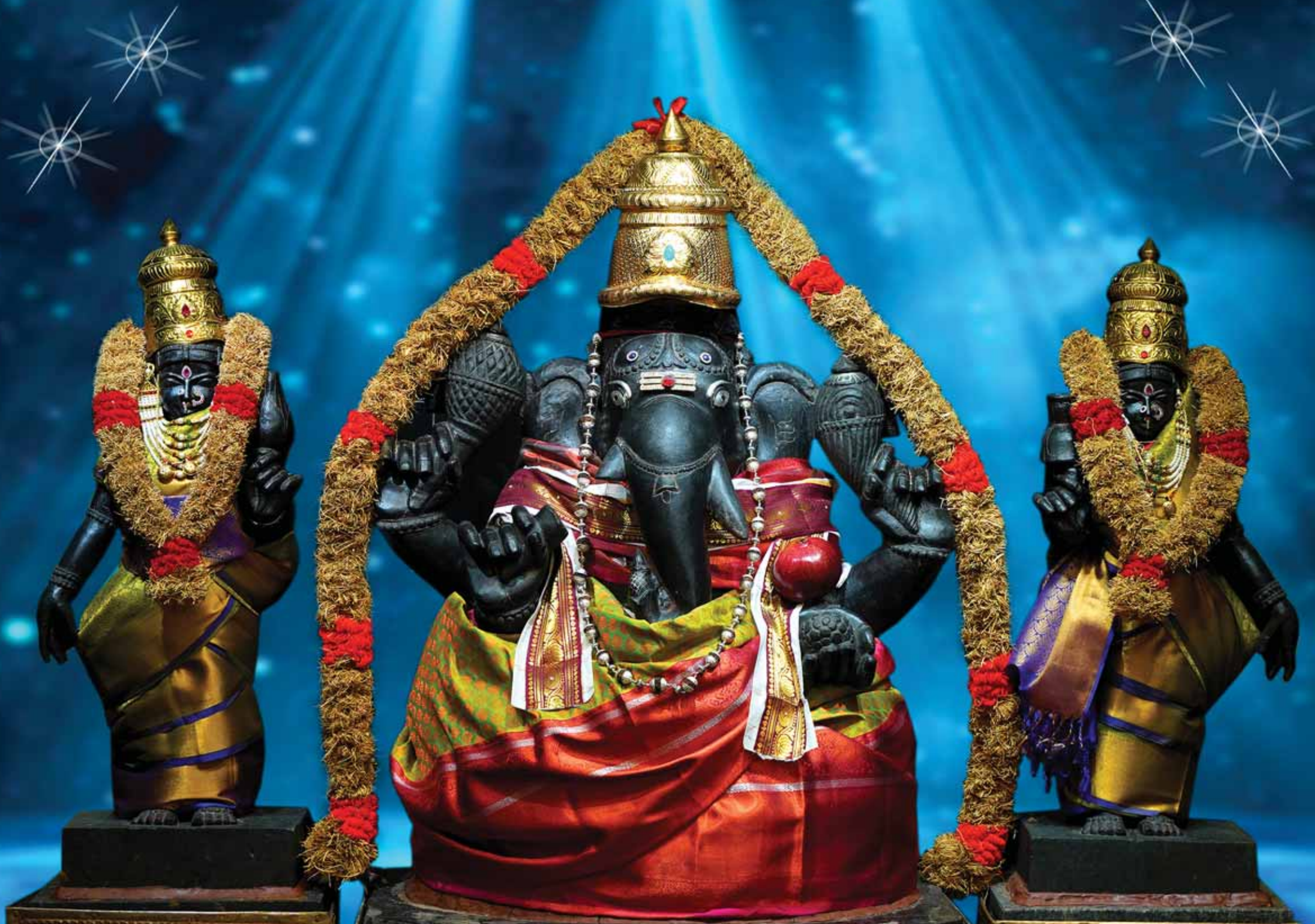
sri siddhi buddhi sameta sri vara siddhi maha ganapathi swami